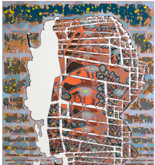
“Mount Meru”, 2012, acrylic on panel, 28 x 26”

While a pseudo-scientific reading of Walker’s imagery is tempting, it is by no means exclusive. Her crowded paintings vacillate between interpretations. Unnamed Meteor, for example, might be a cross-section of an infected plant chloroplast or a space-time schism or an exuberant subway tag — or all of these at once. The press release speaks of the paintings’ mutability: They “serve by turns as objects, territories, and screens for projection. Here at this perspectival point, we are invited to contemplate objects as portals to multi-dimensional perception.” In this respect, Walker’s pictures are little different from Winter’s or, for that matter, from Jackson Pollock’s, Mark Rothko’s or Cy Twombly’s. All of these painters recognized beauty as fundamentally irrational and changeable, a fleeting perception of the real rather than a Platonic ideal.